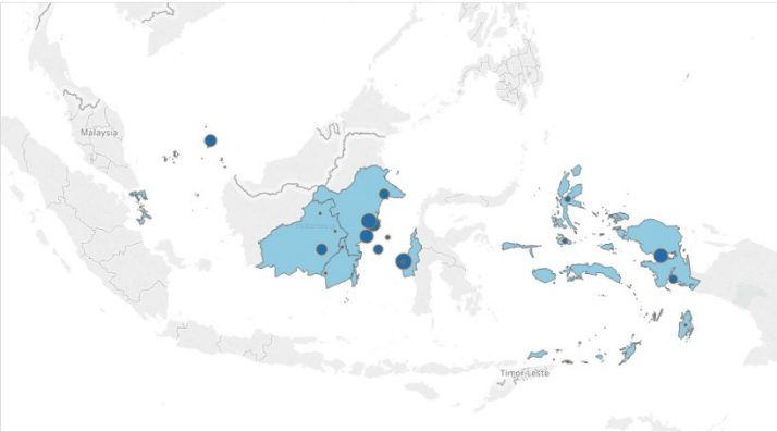
EU Company Disclosure Data: Payment Project by Project Level to Indonesia's Government (2014 - 2015)